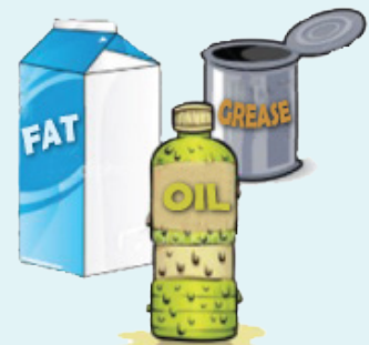
FATS, OILS & GREASE