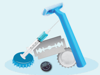
METALS & PLASTICS