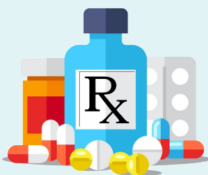
MEDICATIONS & SUPPLEMENTS